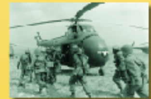
Infantry troops board helicopters from the 6th Transportation Helicopter Company, U.S. Eighth Army, April 1953.