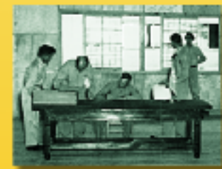
Lt. Gen. William K. Harrison, Jr., signs the armistice for the United Nations at P'anmunjom, 27 July 1953.