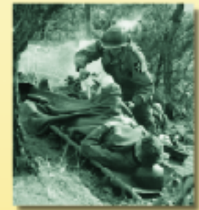
2d Infantry Division medic treats a wounded American soldier, February 1952.

Lt. Gen. James A. Van Fleet's Eighth Army had fortified its positions along Line Kansas and along Line Wyoming, a