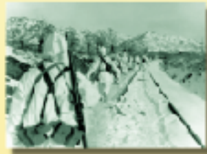
A squad from 2d Battalion, 23d Infantry, moves out from bunker positions at Kungang-san, January 1952.