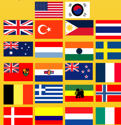
Participating UNC Forces

By 20 July, however, the Eighth Army had retaken the high ground along the river, where it established a new defensive line.