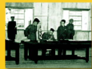
Lt. Gen. Nam Il signs the armistice for the Communists at P'anmunjom, 27 July 1953.