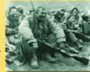
Soldiers enjoy New Year's festivities, January 1952.

By the last week of October the UN's objectives had been secured, and on the 25th the armistice talks resumed—now at P'anmunjom, a hamlet six miles east of Kaesong. When the North Koreans and Chinese dropped their demand that the armistice line be the 38th Parallel, the two sides agreed on 27 November that the armistice demarcation line would be the existing line of contact, provided that an armistice agreement was reached in thirty days. A lull now settled over the battlefield, as fighting tapered off to patrols, small raids, and small unit (but often bitterly fought) struggles for outpost positions. When the thirty-day deadline came and went, as negotiations stalled over the exchange of prisoners of war, among other issues, both sides tacitly extended their acceptance of the armistice line agreement. The continuing absence of large-scale combat allowed the UNC to make several battlefield adjustments, withdrawing the U.S. 1st Cavalry and 24th Infantry Divisions from Korea between December 1951 and February 1952 and replacing them with the 40th and 45th Infantry Divisions, the first National Guard divisions to serve in the war. General Van Fleet also shifted UN units along the front in the spring of 1952, giving more defensive responsibility to the ROK Army in order to concentrate greater U.S. strength in the west.