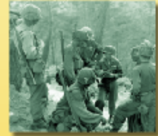
Members of Company I, 160th Infantry, are briefed prior to going on a reconnaissance patrol along the front lines, June 1952.