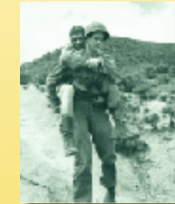
One member of the 27th Infantry Regiment carries another, hit in the leg, back to an aid station, 21 September 1950.