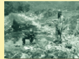
Soldiers of the 27th Infantry Regiment search for mines near Chinju, 21 September 1950.