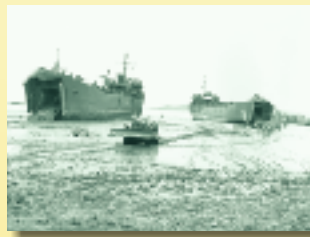
A bulldozer moves through the muddy shore of Wolmi Island at Inch'on as equipment is unloaded from LSTs, 16 September 1950.