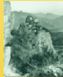
Infantrymen of the 5th Regimental Combat Team look down on a North Korean position during the Eighth Army's drive along the Nakdong River toward Taejon, 22 September 1950.

Meanwhile, on 16 September the Eighth Army began its offensive. The ROK I and II Corps were positioned on the north of the Pusan Perimeter; the U.S. I Corps (composed of the 1st Cavalry Division, the 27th British Commonwealth Brigade, the 24th Infantry Division, and the ROK 1st Division) moved from the Taegu front; the U.S. IX Corps, including the 2d and 25th Infantry Divisions and attached ROK units, was poised along the Nakdong River. Walker's forces moved slowly at first, but by 23 September the envelopment threatened by X Corps and Eighth Army became clear, and the North Koreans broke to the north. Elements of X Corps' 7th Division and of the 1st Cavalry Division, Eighth Army, linked up on 26 September just south of Suwon. Seoul was liberated the next day, and MacArthur returned the capital to President Syngman Rhee on 29 September. By the end of September the North Korean Army no longer existed as an organized force in the southern republic. The border along the 38th Parallel had been restored.