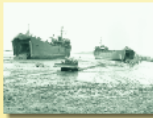
A bulldozer moves through the muddy shore of Wolmi Island at Inch'on as equipment is unloaded from LSTs, 16 September 1950.