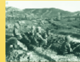
Ready for action: a 50-caliber machine gun crew of the 1st Cavalry Division near Taejon, 22 September 1950.