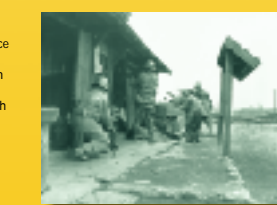
The 1st Cavalry Division attacks in a train yard in the North Korean capital, P'yongyang, 19 October 1950.

On 19 October the I Corps' 1st Cavalry Division and the 1st ROK Division entered P'yongyang, the North Korean capital. On the 24th MacArthur ordered his commanders to advance as quickly as possible, with all forces available, so that operations could be completed before the onset of winter. The press of the Eighth Army in the west was relentless, as it sent separate columns north toward the Yalu River, each free to press forward independently. On the 26th an ROK regiment sent reconnaissance troops to the town of Ch'osan, thereby becoming the first UN element to reach the Yalu.