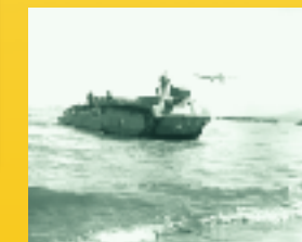
Marines of the 1st Division bring supplies ashore using an amphibious tractor at Wonsan, 27 October 1950.