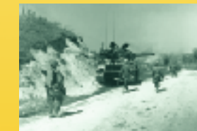
American troops march toward the North Koreans near Kumch'on, 24 September 1950.