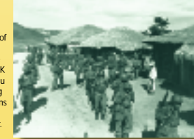
Troops of the 32d Regiment, 7th Infantry Division, advance through a Korean village six miles southeast of Inch'on, 18 September 1950.

troops of the 32d Regiment, 7th Infantry Division, advance through a Korean village six miles southeast of Inch'on, 18 September 1950.