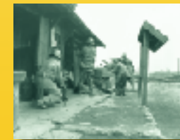
The 1st Cavalry Division attacks in a train yard in the North Korean capital, P'yongyang, 19 October 1950.