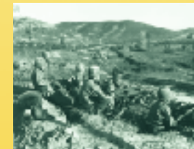
Ready for action: a 50-caliber machine gun crew of the 1st Cavalry Division near Taejon, 22 September 1950.